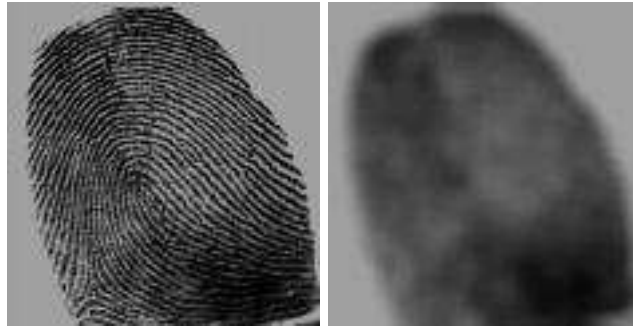
FIGURE 1. Top left: original image. Top right: blurred version.

we define the corresponding frame operator F ,