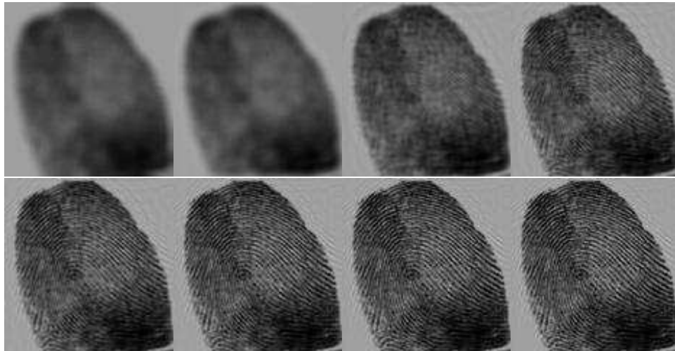
FIGURE 2. Top left to bottom right: blurred image, several iterates using the wavelets scheme: 1st, 100th, 500th, 1000th, 2000th, 3000th, 4000th.