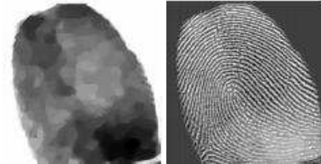
FIGURE 5. Decomposition into cartoon (left) and texture (right) of the fingerprint image without blur, obtained using the model (15).