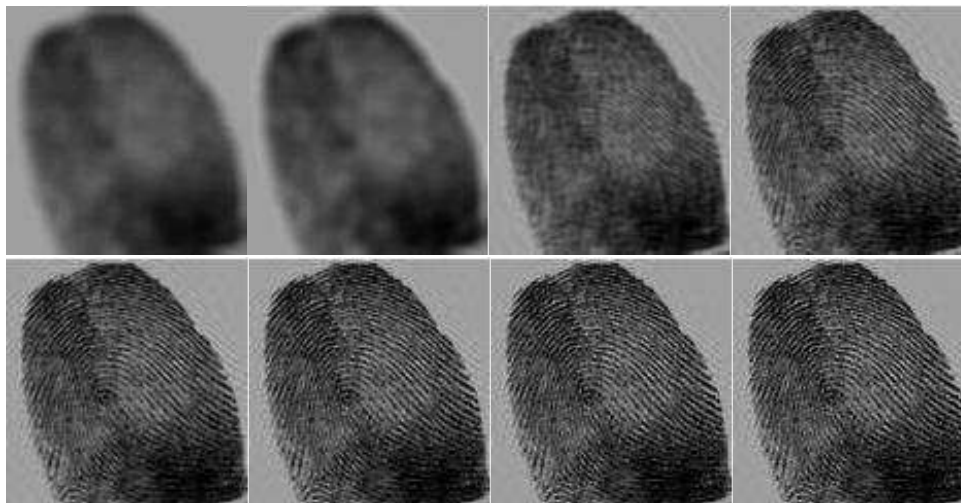
FIGURE 3. Top left to bottom right: blurred image, several iterates using (11): 1st, 100th, 500th, 1000th, 2000th, 3000th, 4000th.

note that the numerical results in Table 2 were obtained on a different computer and should thus not be compared with this Table.) Finally, we show in Figure 5 the result of a Cartoon+Texture decomposition of the same image (without blur) obtained by the surrogate-based iteration (15).